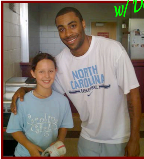
2009 NCAA Champion, Final 4 Most Outstanding Player, NBA 1 st -Round Draft Pick and Episcopal star Wayne Ellington spoke at Sky High Camp!