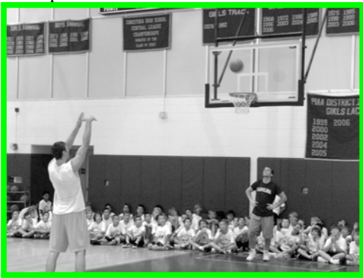
1 st Round Draft Pick Tyler Hansbrough of the NBA's Indiana Pacers speaks and works out for Sky High Campers

Above all else, parents can be confident that their child is having a great time in a safe, caring and controlled environment. Our camper to staff ratio averages 8:1, and we are certain to be attentive to each camper's needs.