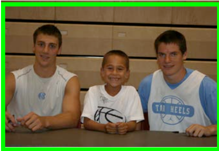
Campers took personal photos with 2009 National Champions Tyler Hansbrough and Bobby Frasor of UNC

"I've been going to Sky High Basketball Camp for 4 years and it's my favorite summer camp. The coaches are great and the camp really improved my basketball skills. And, I got some good autographs!"